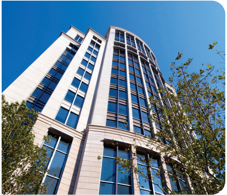
A fretwork of Solarban ® 60 Optiblue ® glass, framed by Indiana limestone, highlights the façade of Rosewood Court in Dallas' prestigious Uptown neighborhood.

In a standard 1-inch insulating glass unit, Solarban ® 60 Optiblue ® glass balances visible light transmittance (VLT) of 51 percent with a solar heat gain coefficient (SHGC) of 0.31.